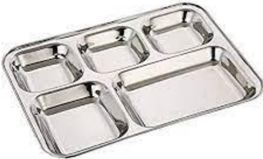
Diagram of Item No. 1 & Each container should be 1 inch deep (Dining Thatu)