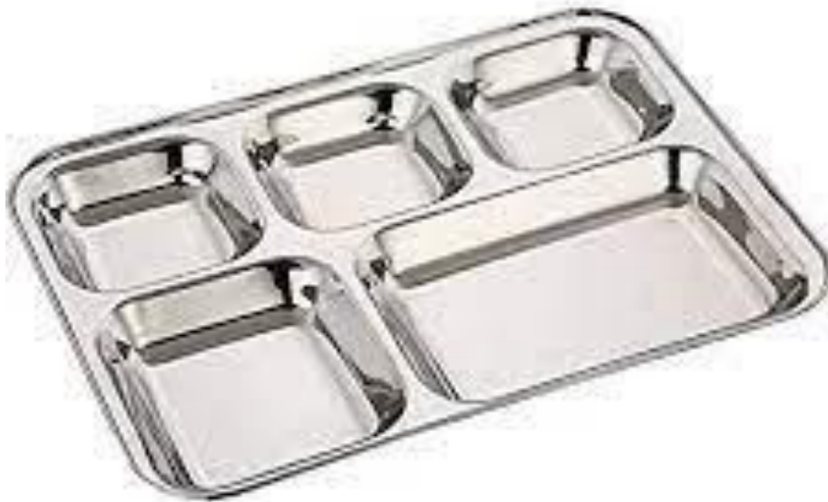
Diagram of Item No. 1 & Each container should be 1 inch deep (Dining Thatu)